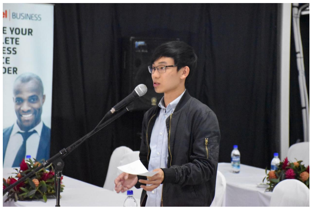
Youth participating in the Townhall session in APrIGF.