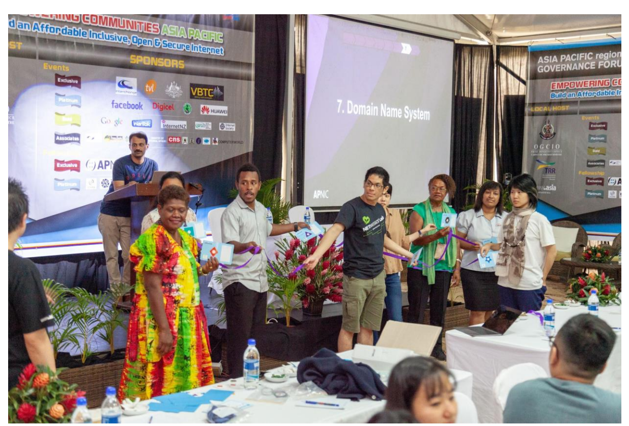
\label{lem:lem:netMission} \textbf{NetMission Ambassadors were also joining the Capacity Building Day}.