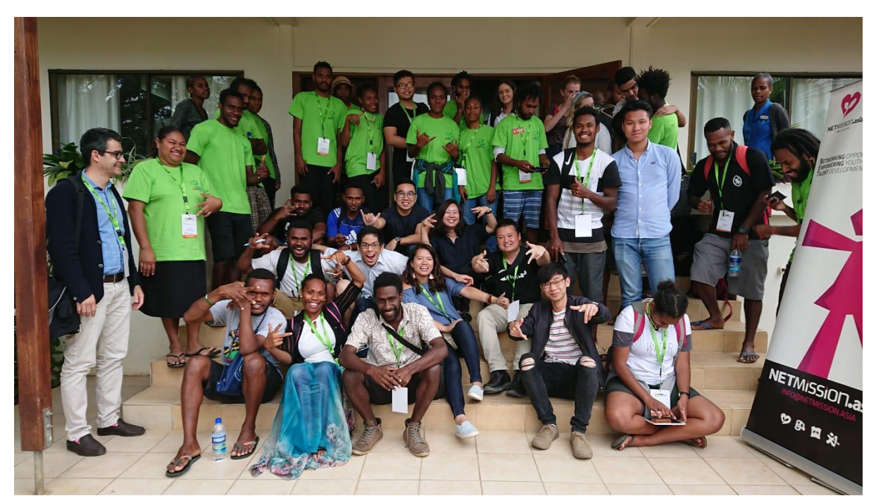
All of the honourable guests, participants and the organising committee were excited to take a group photo to capture the perfect moment.