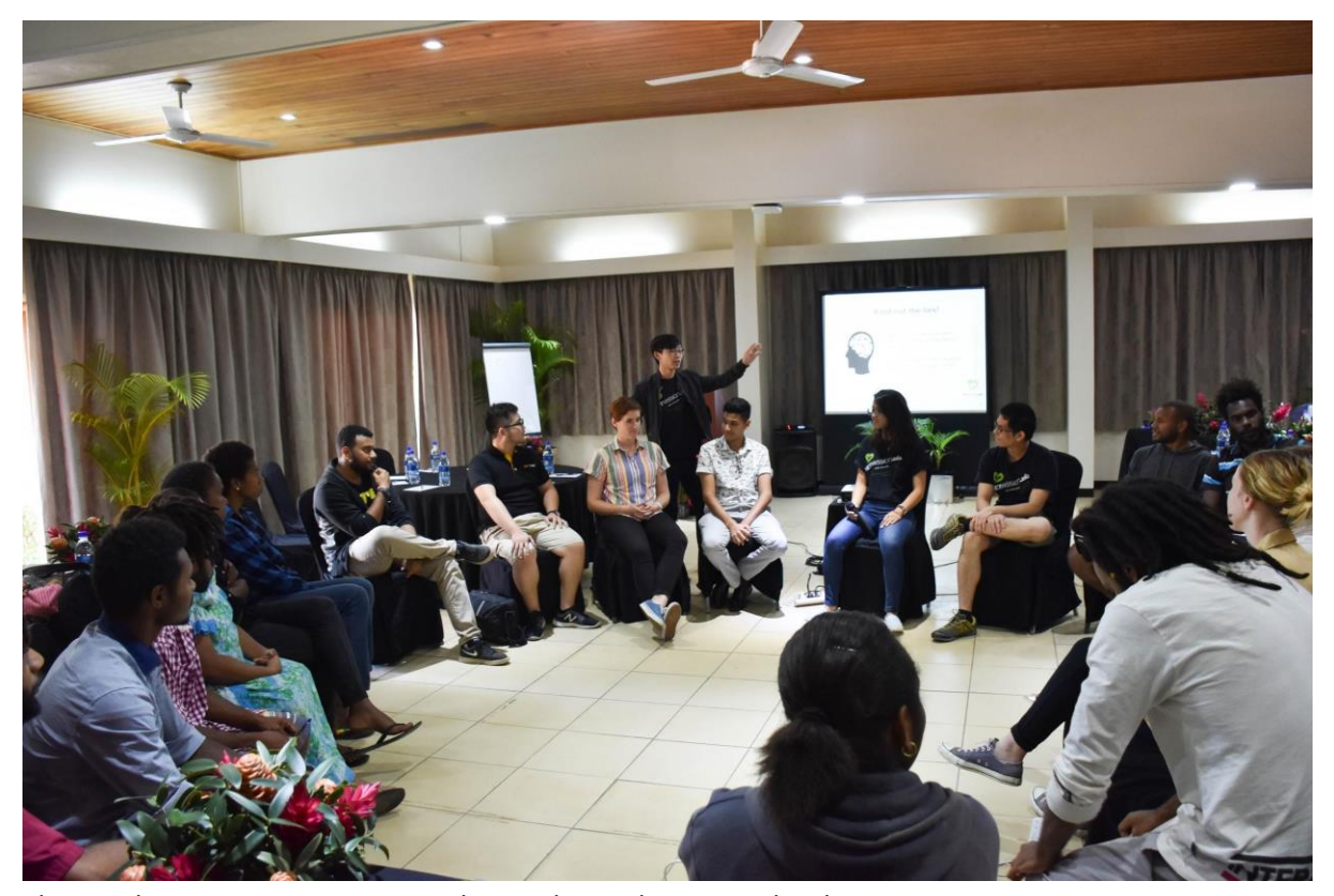
The youth participants were introducing themselves to each other.