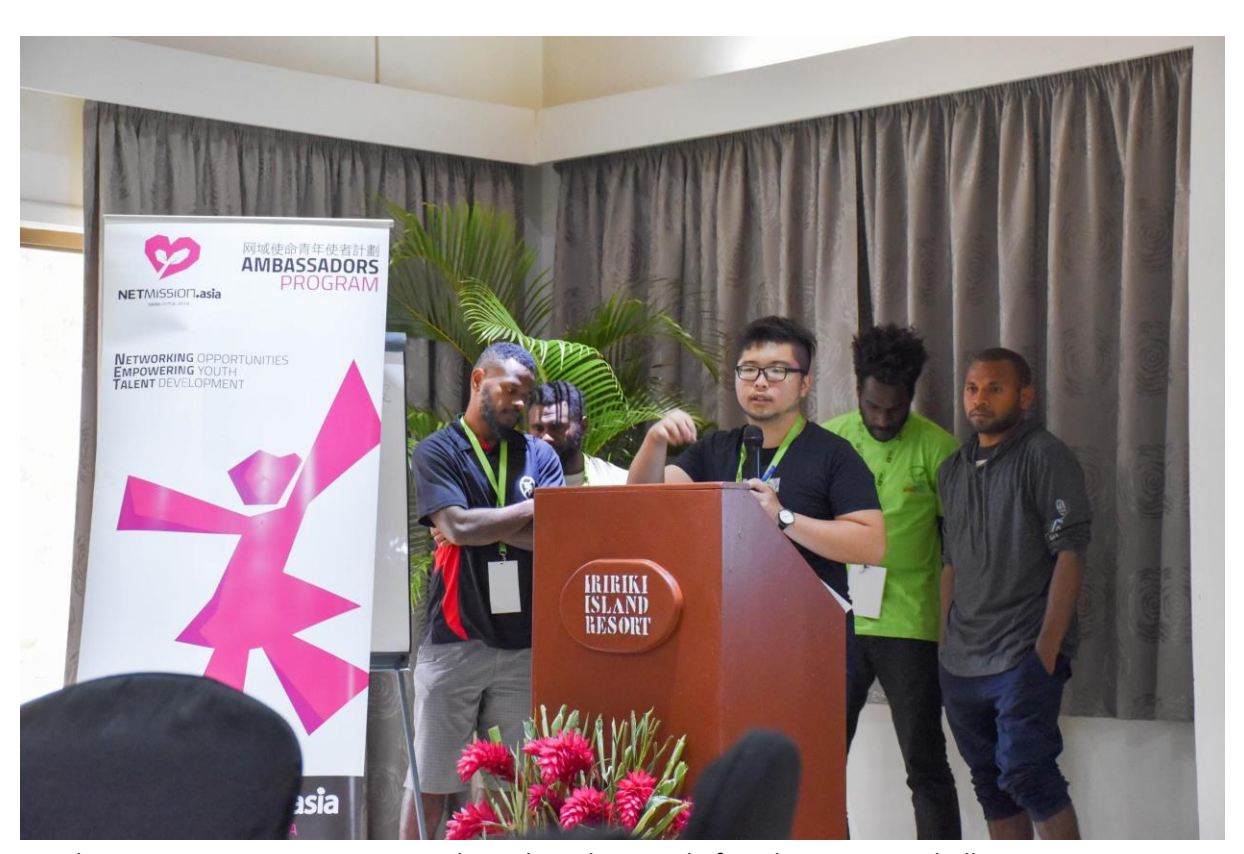
Youth participants were presenting their ideas discussed after the mini-townhall session.