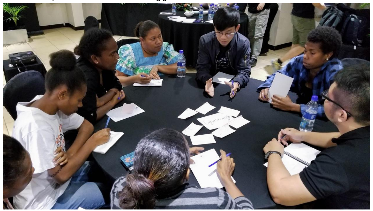
Participants were exchanging their ideas in the idea wall session.