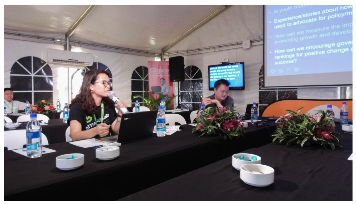
Our NetMission Ambassador was participating in the YMI workshops in APrIGF.