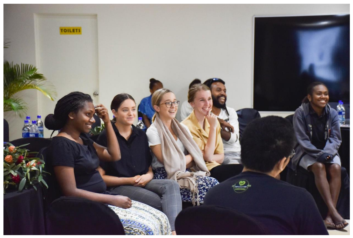
Kickstart our yIGF with various ice-breaking games.