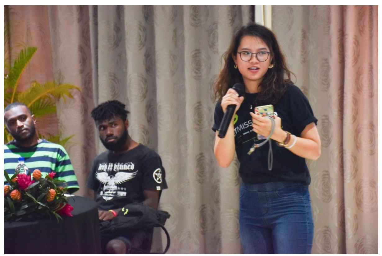
Our organising committee was discussing how we can contribute in the synthesis document with our youth participants.