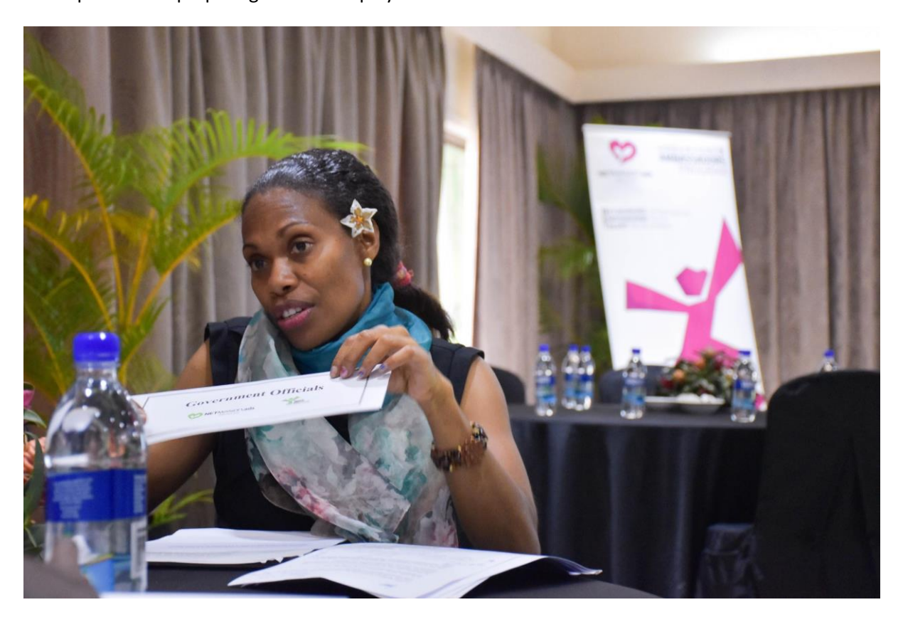
Participants were actively voicing out their opinions in the roleplay discussion.