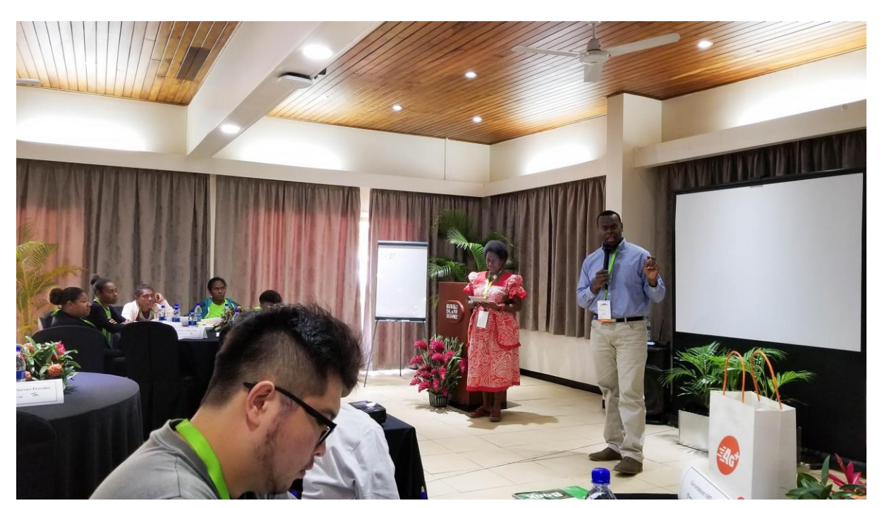
Our honourable guests were sharing their experiences and insights with the participants before the roleplay discussion begins.