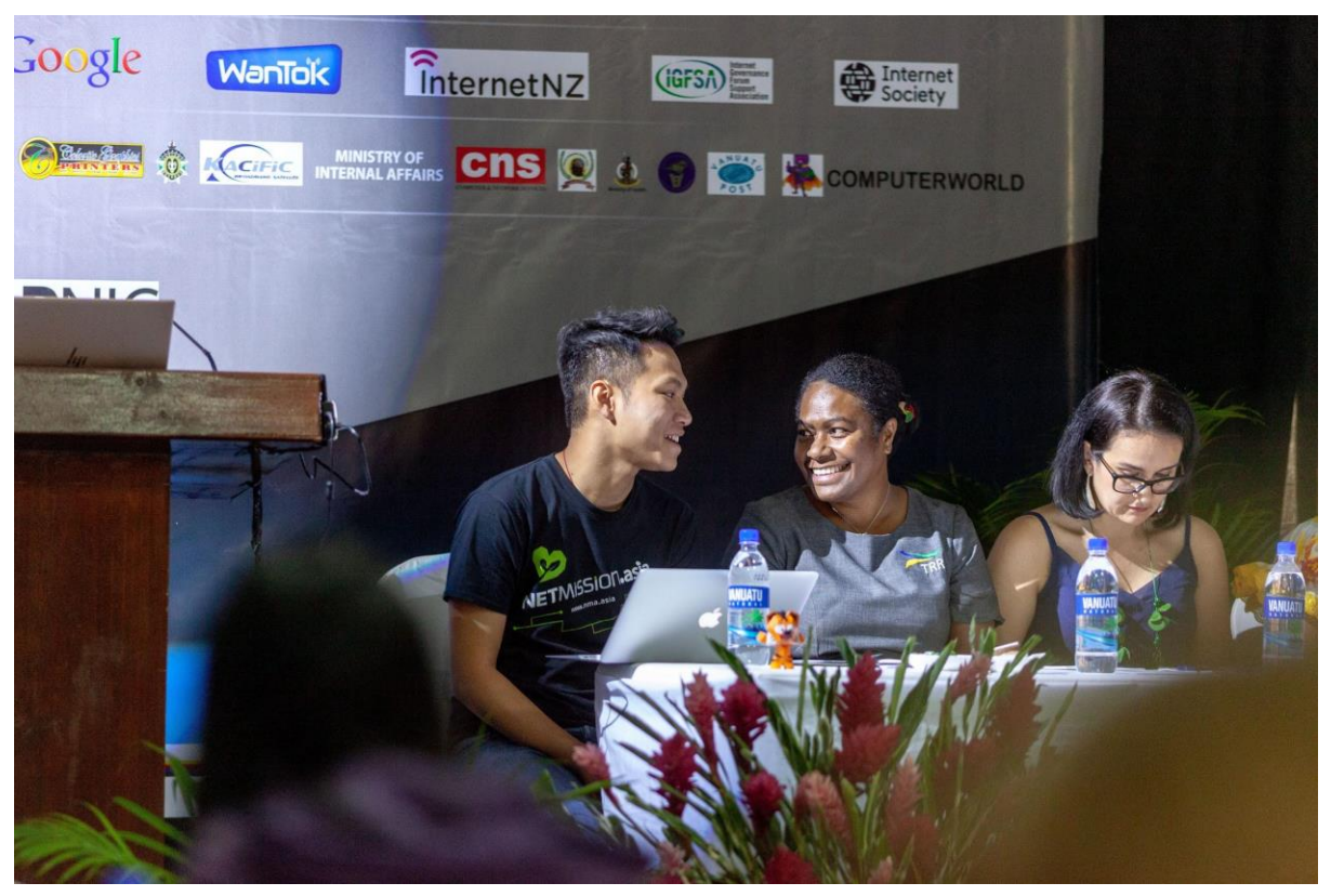
NetMission Ambassador was sharing his journey on Internet governance in APrIGF.