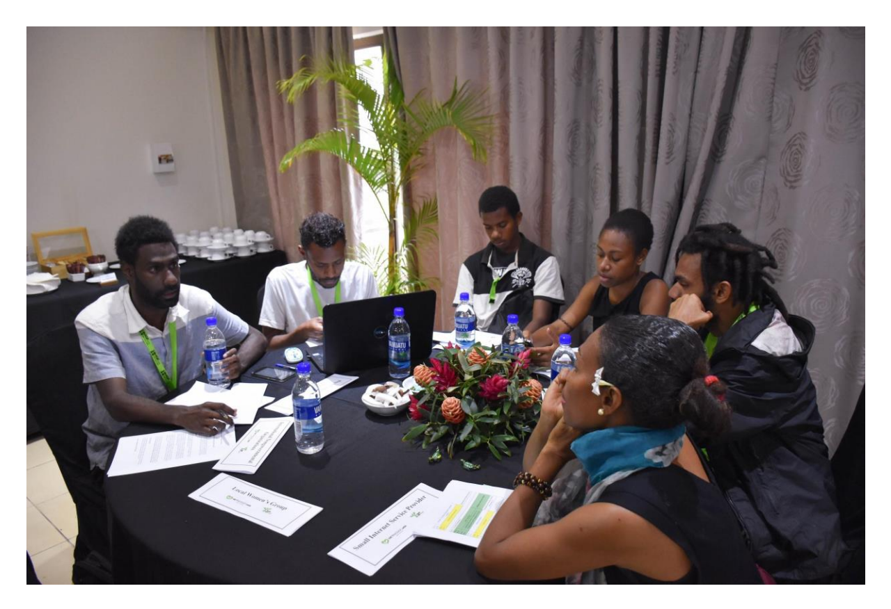
Participants were preparing for the roleplay discussion.